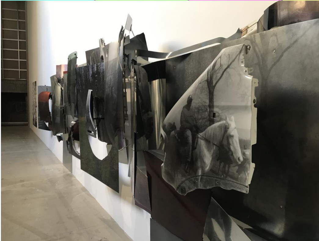
Mohamed Bourouissa, The Ride, 2017, Courtesy of the artist