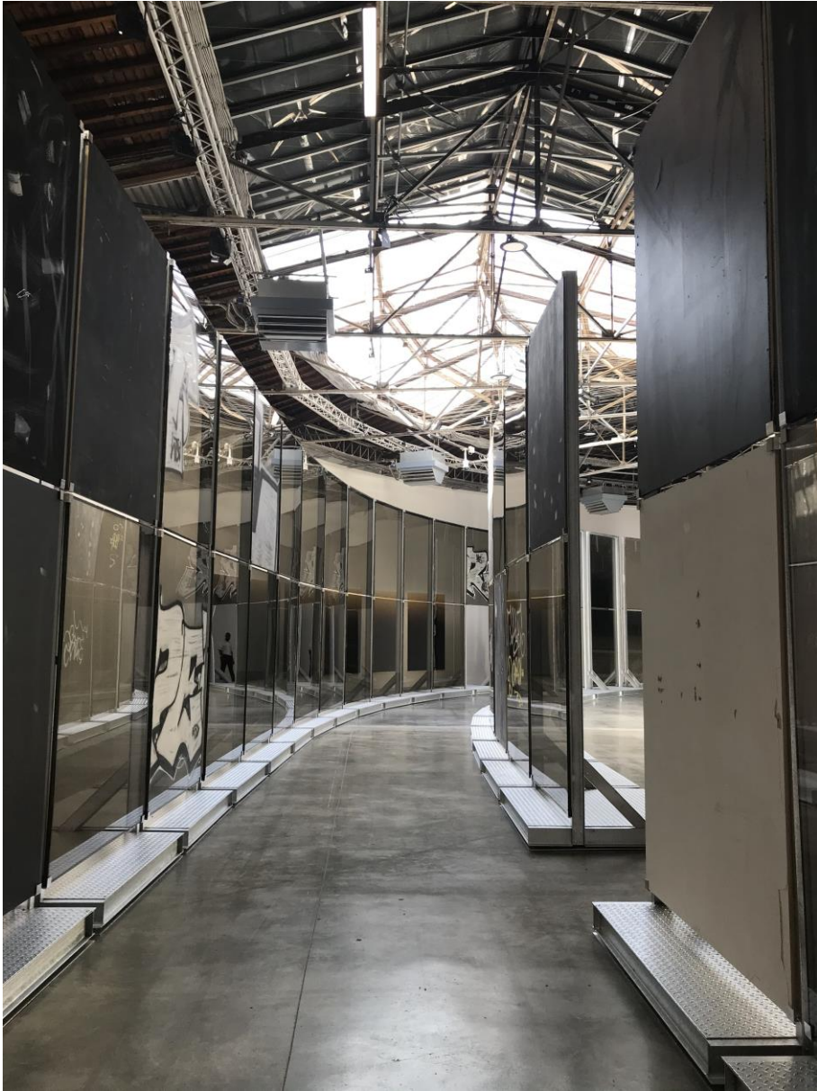
Anne Imhof, Untitled (Natures Mortes), 2021