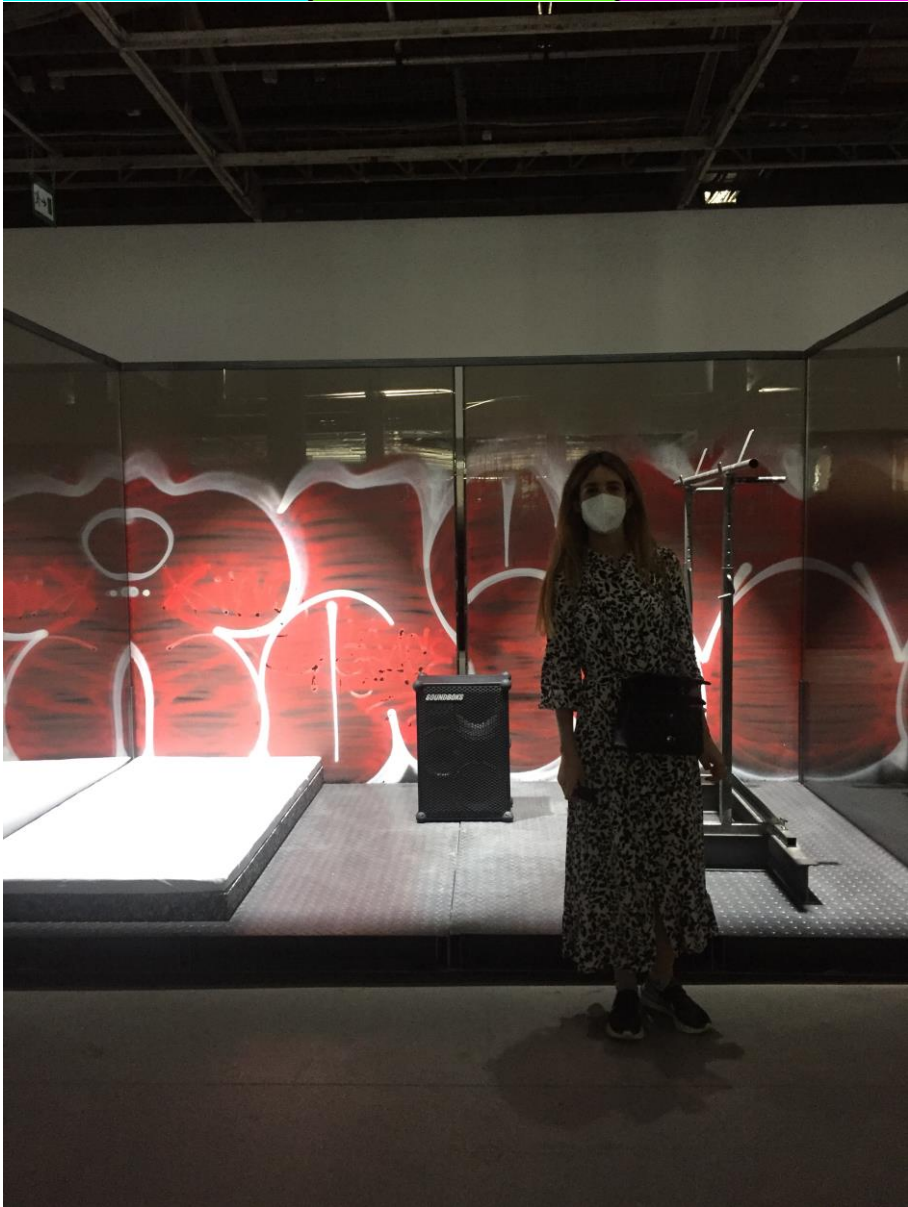
Photo of the author in the path at the level - 1