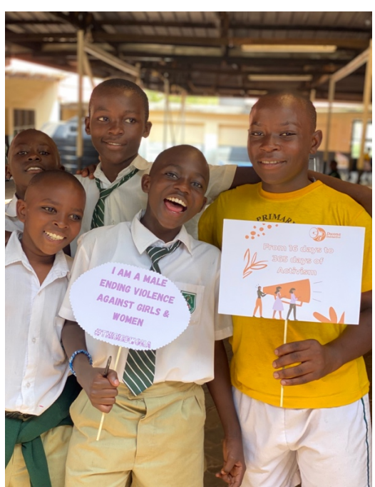
Children at Nakasero Primary School excited after their art gender-steorotypes' session

With the ultimate goal of teaching children to be responsible leaders that advance gender equality without fronting violence in all social aspects, the campaign was conducted in 4 primary schools, 2 secondary schools, and 1 rural community together with partner community-based organizations in Kampala, Wakiso and Mukono districts.